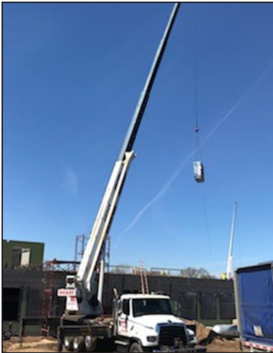
Left: Flying in air handling unit #7