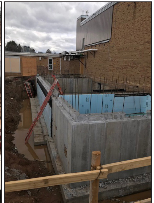
Left: Basement Underground Plumbing