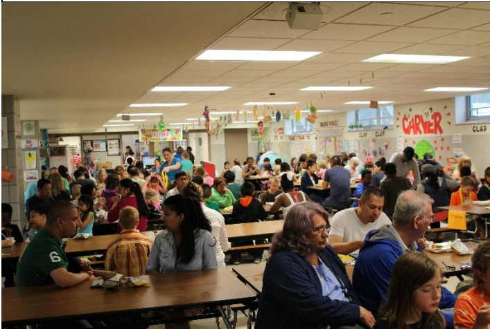
Carver Family Picnic was held indoors due to rain